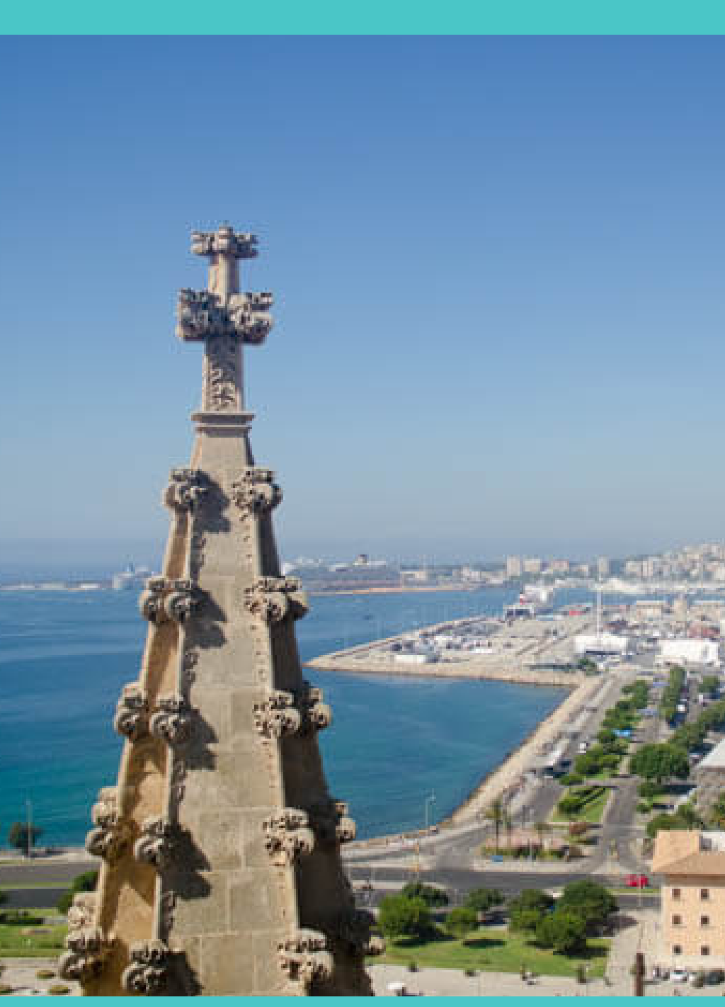
Mallorca für Kinder